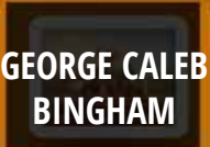
GEORGE CALEB BINGHAM