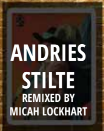
ANDRIES STILTE REMIXED BY MICAH LOCKHART