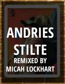
ANDRIES STILTE REMIXED BY MICAH LOCKHART