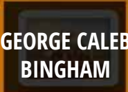
GEORGE CALEB BINGHAM