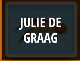
JULIE DE GRAAG