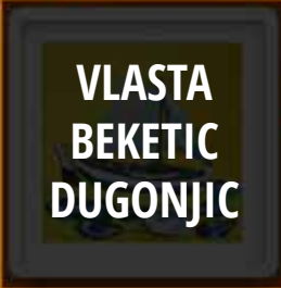
VLASTA BEKETIC DUGONJIC